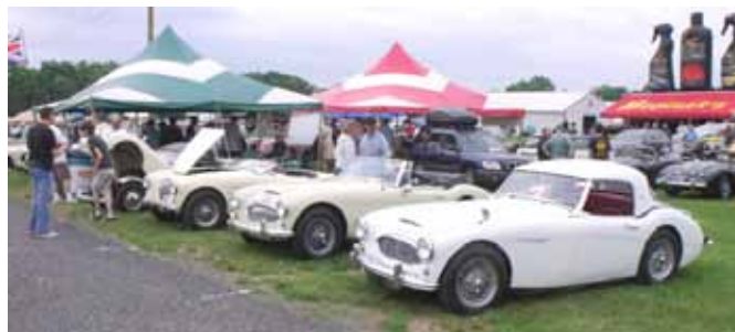
Hooper's Bugeye, Charlie Grove 100, Unknown BJ7, Rishell BT7