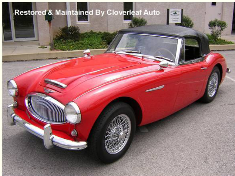
Restored & Maintained By Cloverleaf Auto

Repair, Restore, Maintain & Improve Your Austin-Healey