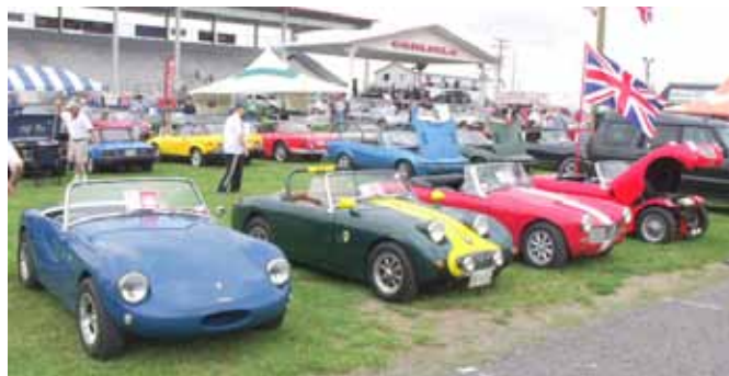
Sprites, unknown owners.