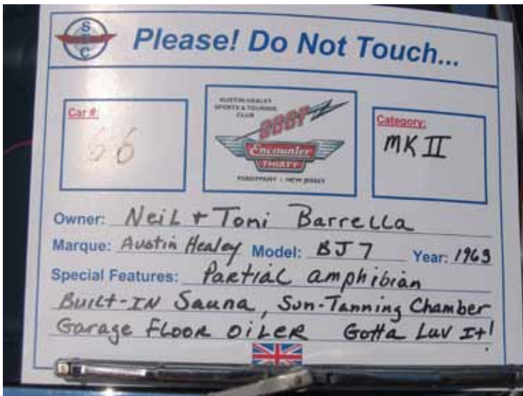
This says it all!

Included this month are one old photo and one new photo. The old is a photo of the placard on Neil Barrella's BJ7 at Encounter 2008. The new one is Rich Miot's BJ8 when it first emerged from the garage this season.