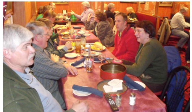
Members present at the Hillside Steak House