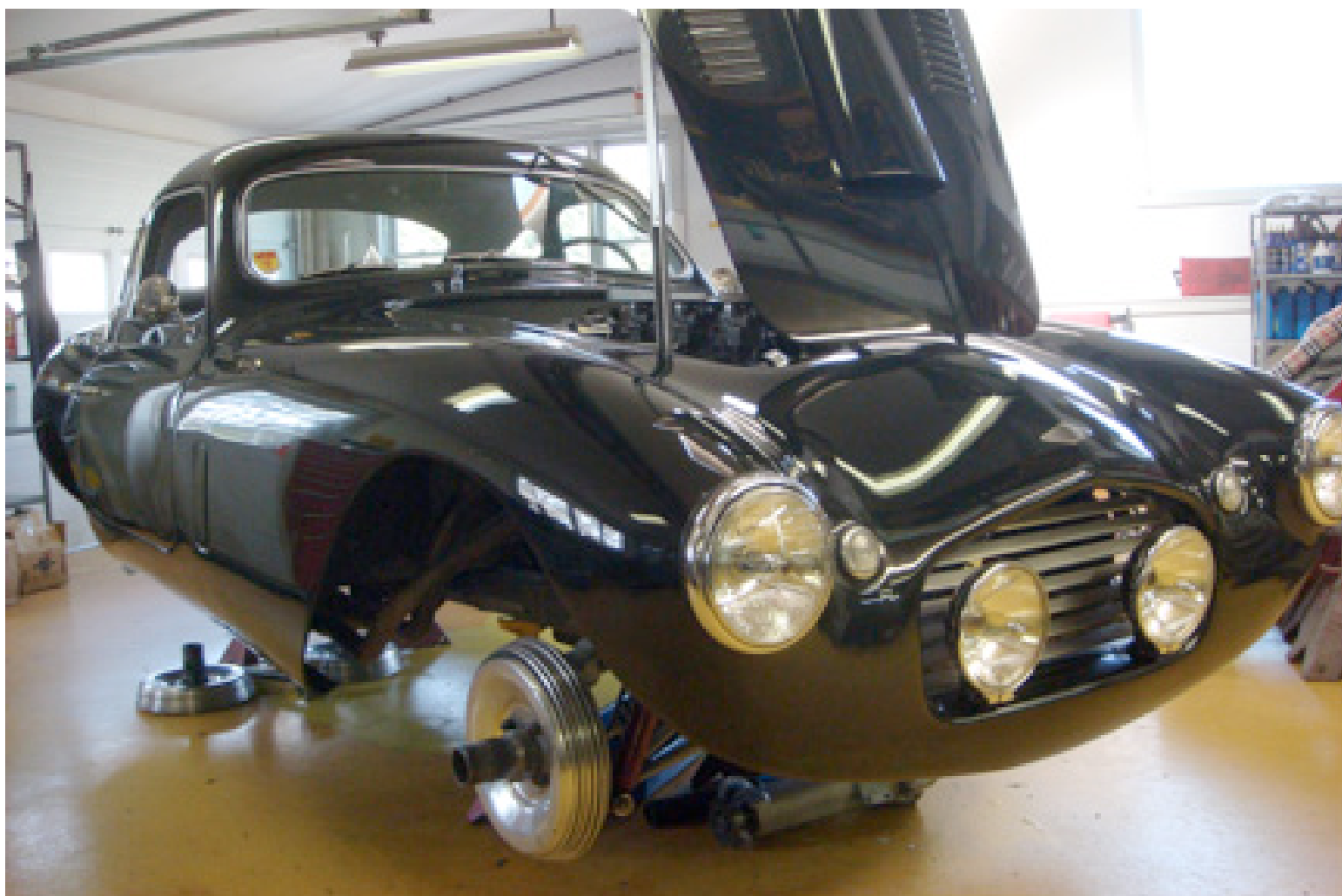
1954 Frazer-Nash Coupe