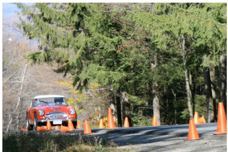
Healey In Its Element - Rowe Hill Climb