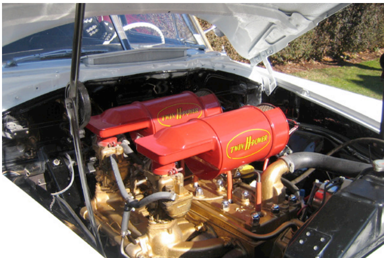
Twin H Power