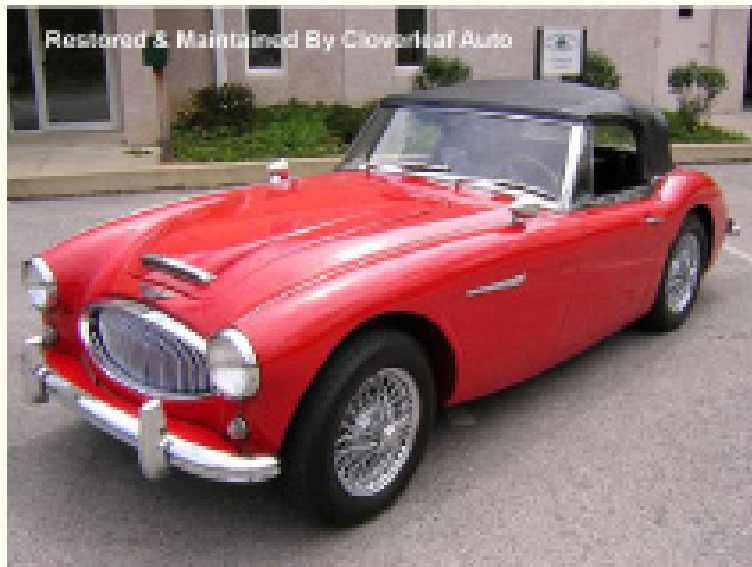
Restored & Maintained By Cloverleaf Auto

Repair, Restore, Maintain & Improve Your Austin-Healey