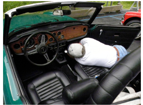
This is what happens when you bring a Triumph on an Austin-Healey club road tour!