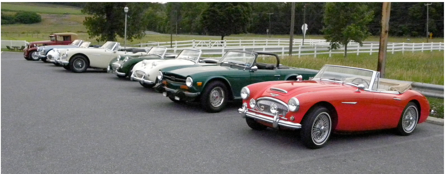
What a great lookin' bunch of cars!