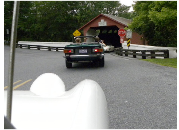
Approaching the first covered bridge on the tour.