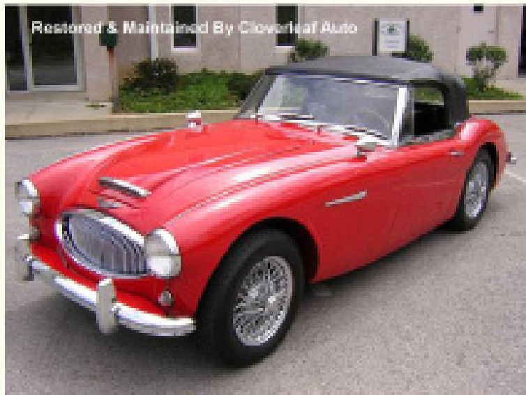
Restored & Maintained By Cloverleaf Auto

Repair, Restore, Maintain & Improve Your Austin-Healey