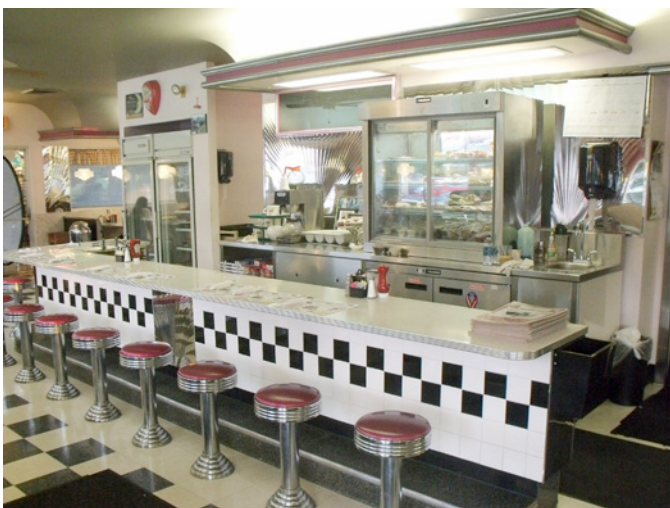
Inside the Soda Jerk

NOTICE: Meeting, next month will be held at the picnic at Bennett's, - no separate meeting is required and remember to take it easy on them – we've never invaded their place before. See you there.