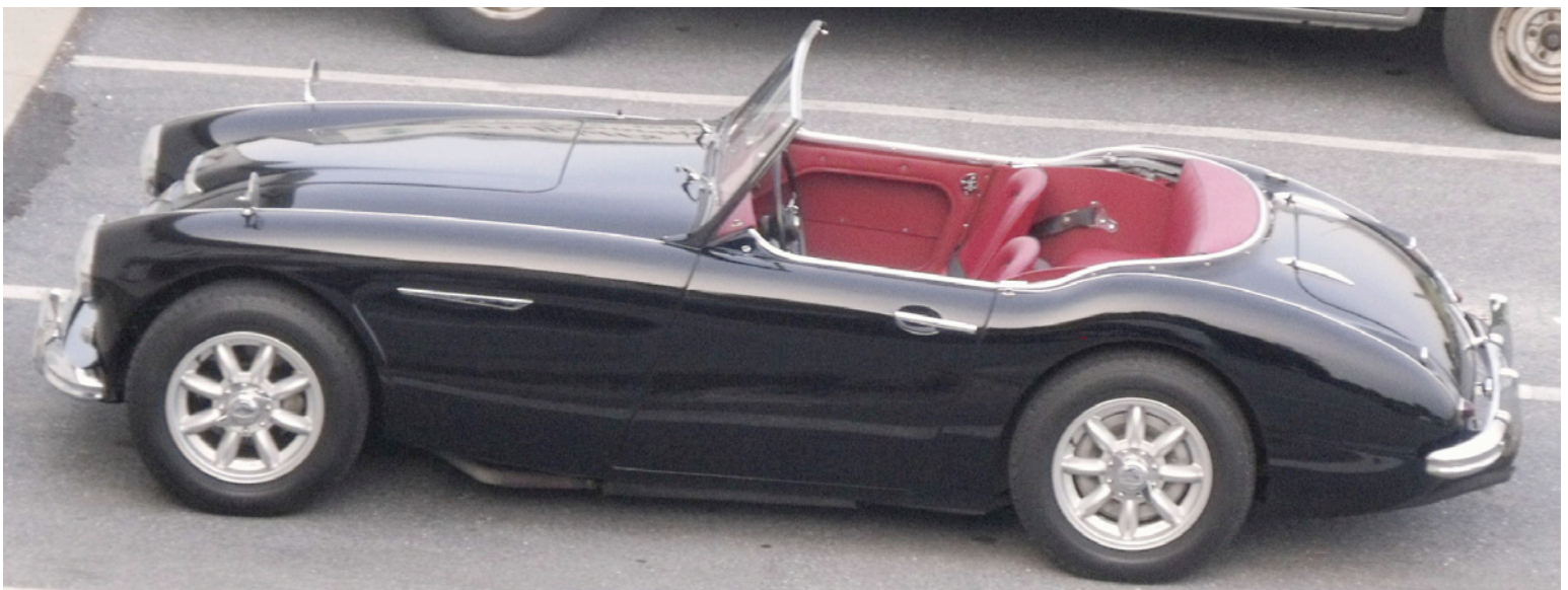
Charlie Baldwin's tricarb BT7