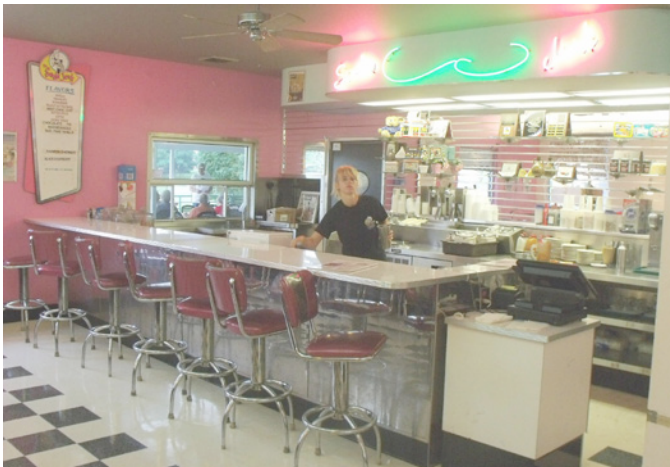
The ice cream bar at the Soda Jerk

Del covered some schedule updates including the regions summer picnic, formerly at Wagmans, which is