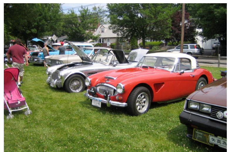
Healeys between Buicks and Toyota, Oceanside show