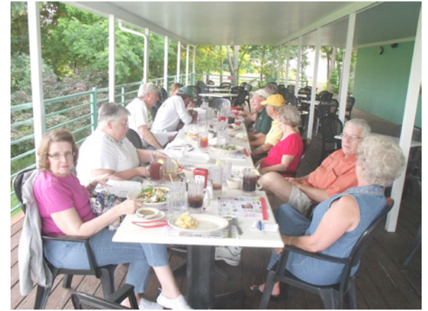
Members present at the meeting