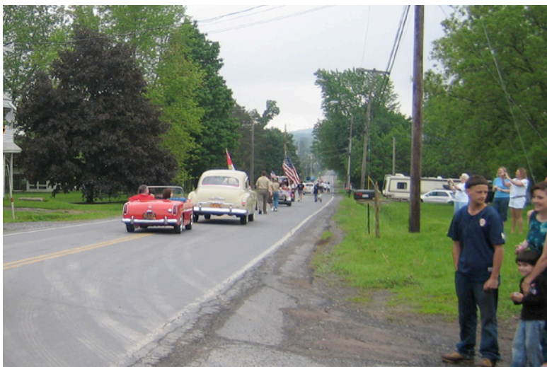
Memorial Day Parade with Sprite