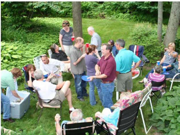
Enjoying the Picnic