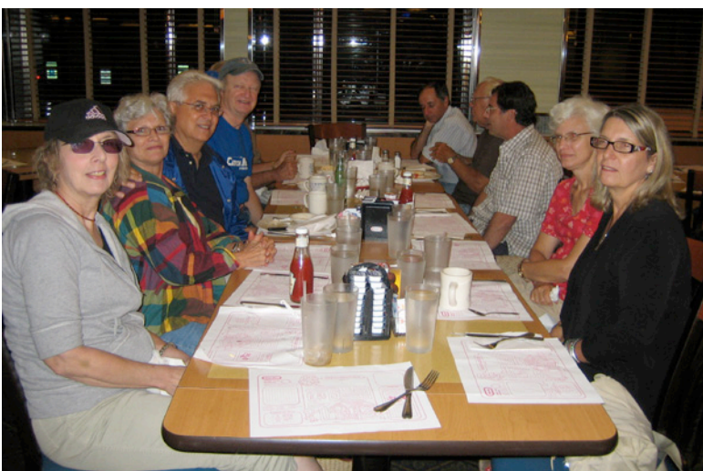
LI group at the diner after Beach Run