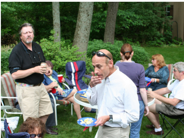
Enjoying the Picnic