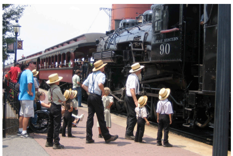
Strasburg RR this July