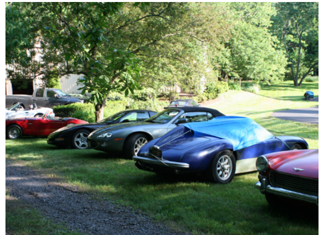
Healeys at the Picnic