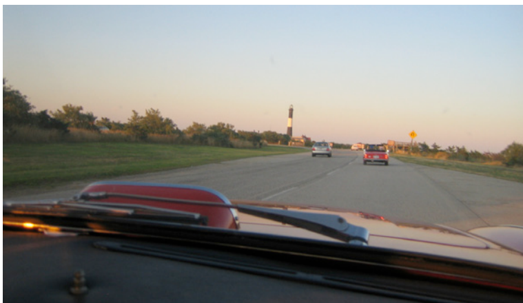
Beach Run on the way to Fire Island Lighthouse