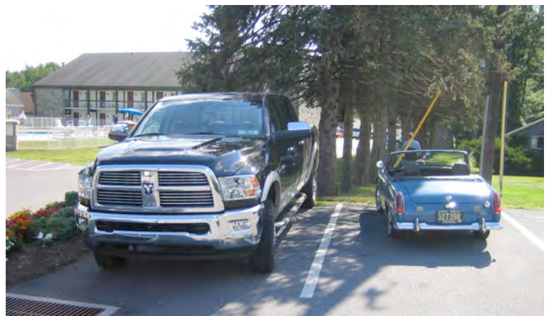
Very Big and Very Small