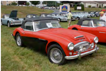
3000 Mark III Single Light