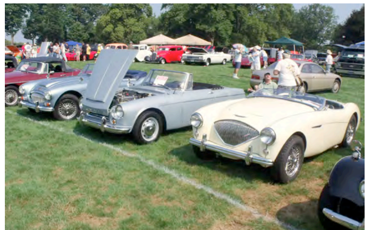
Joe Spear's BJS, Charlie Grove's 100 with an interloper between