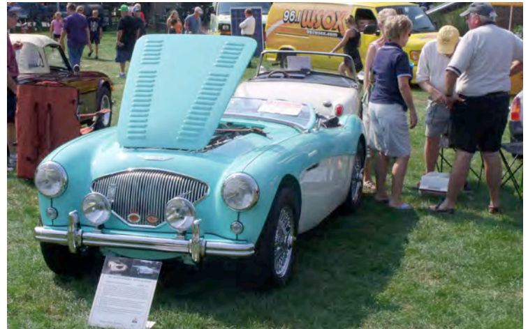
Don Schneider's 100 M