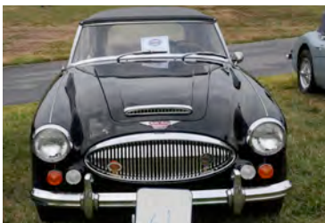
3000 Mark III double light