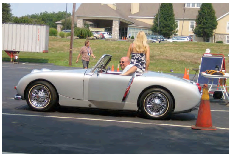
Van Ness Sprite Kids' Choice Best of Show