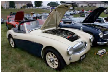
3000 Mark II