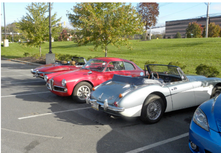
A mixed bag of entrants for the LV Region Rallye - Jaguar/Alfa-Romeo/Mazda/BMW - and oh, yeah, a couple of Healeys!