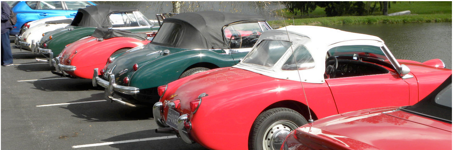
"Healey hineys" (plus a couple of Mazda interlopers) at Blue Mountain Vineyard.

We're looking at holding our Region Christmas Party at the Spinnerstown Hotel in beautiful downtown Spinnerstown on Saturday, December 3, with the Region subsidizing some of the cost. We'll discuss this at the November meeting. Watch for E-Flashes for further details on the party and on other pending Region events.