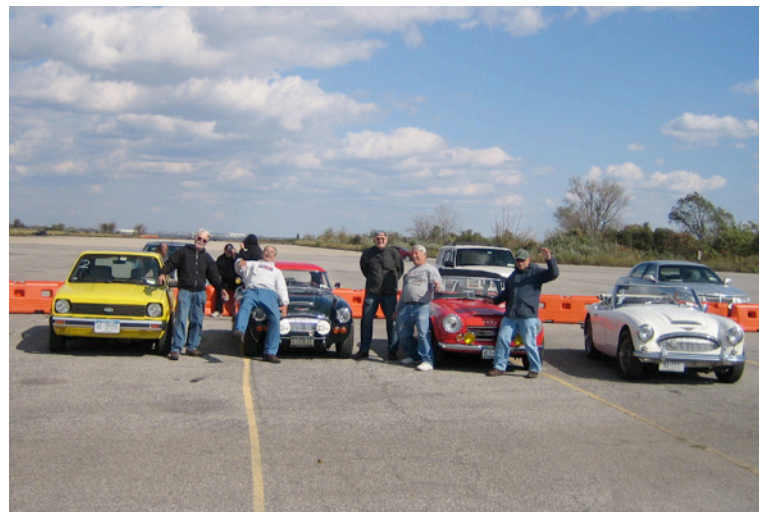
Intrepid Healey drivers, Floyd Bennett Field