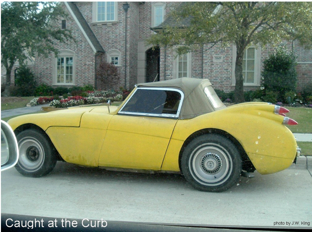
Caught at the Curb

Also as we get ready for winter and are putting our cars away I came across this link from Moss explaining how to store you pride and joy. www.mossmotors.com/storage