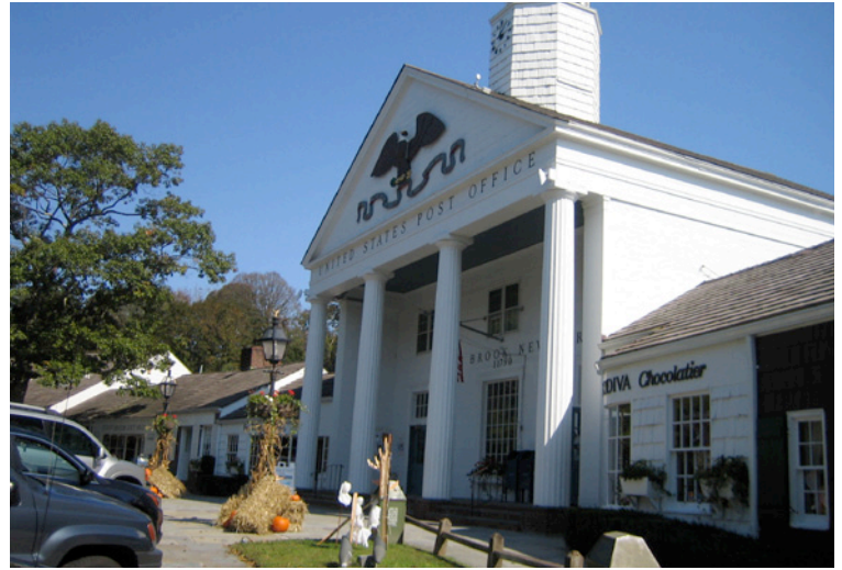
Stony Brook P.O. with the flapping eagle wings (really!)

The MGCLIC Fall Foliage Tour is scheduled for Oct. 30 but you will have to wait to read about it till January as, per usual, there will be no Flash in December.