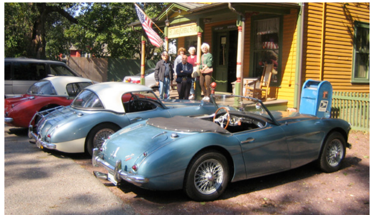
St. James General Store