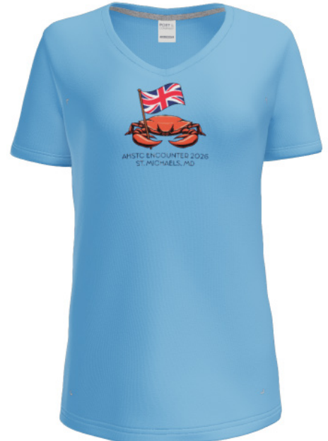
Port & Co. Women's Performance Blend V-Neck Tee