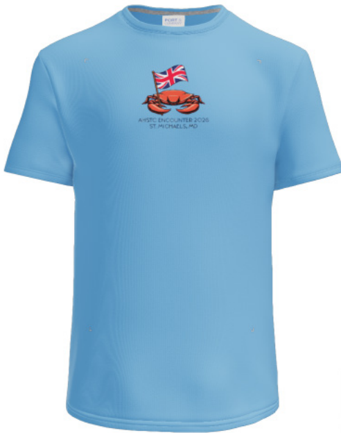
Port & Co. Performance Blend Tee

Details/size charts online at encounter2026.com