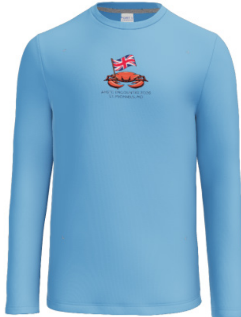
Port & Co. Long Sleeve Performance Blend Tee